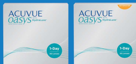
ACUVUE® OASYS 1-Day