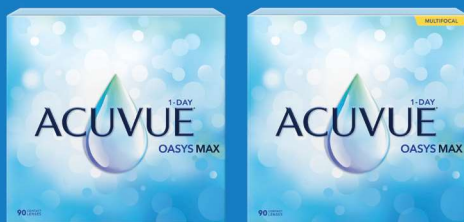
ACUVUE® OASYS MAX 1-Day

New to these Brands? You're eligible as a New Wearer.